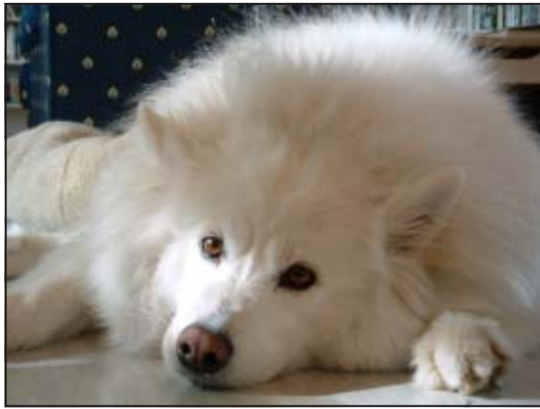
Sasha relaxing in the USO center in Tuzla, Bosnia, 2003. (Below) Photos of Sasha at locations throught the world.